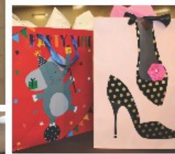
Dozens of special door prizes