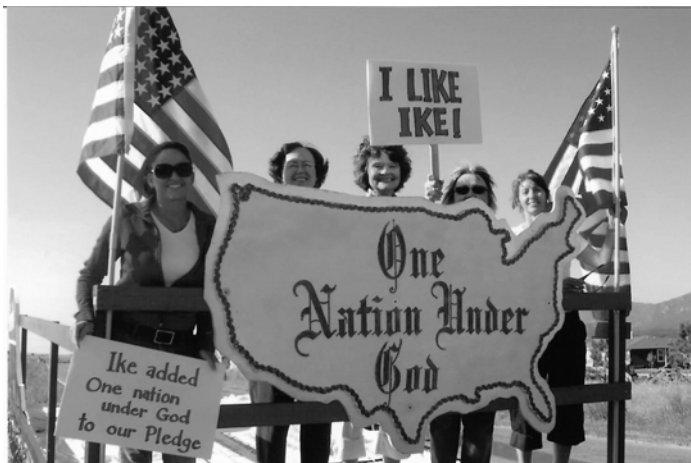
Sunrise Republican Women Monument 4th of July Parade award-winning float