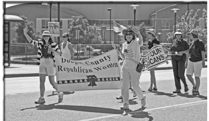
Douglas County Republican Women on the move!