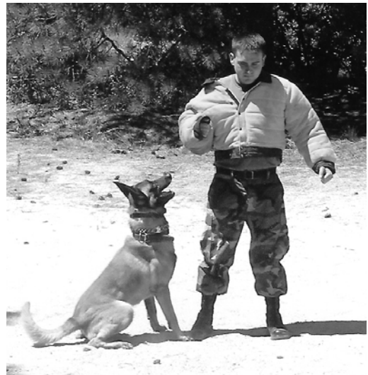
Air Force Academy K-9 demonstration at the Sunrise RW July picnic.