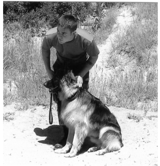
Air Force Academy Bomb-sniffing dog demonstration at the Sunrise RW July picnic