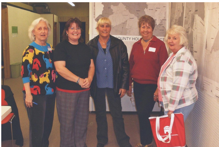
The retiring Board for the Royal Gorge RW club.