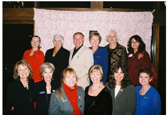
Mountain Republican Women's Club Pays Tribute to Tom Tancredo