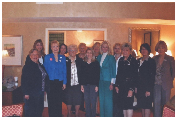
Luncheon at the Brown Palace with Cindy McCain