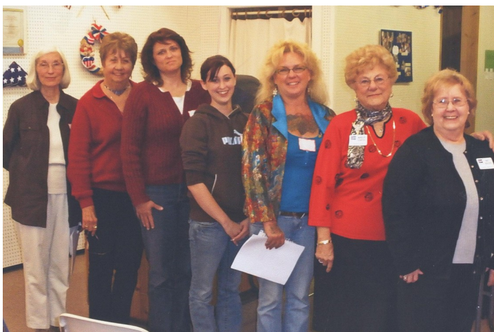
New Board for the Royal Gorge Repub. Women club