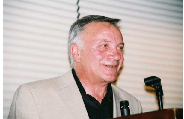
Tom Tancredo at Mountain Republican Women's Club